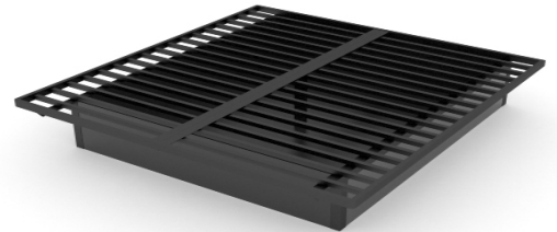
KING MATTRESS SIZE: 76" W x 80" L