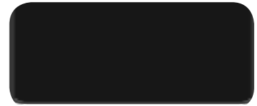
PANEL COLOR BLACK CRYSTAL BC

Available in King, Queen and Full XL NO FOUNDATION/BOX SPRING REQUIRED. JUST MATTRESS